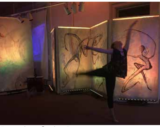
"streaming reflections" installation view with LED changing colored lighting, dancer Ellyanna Hope Anderson