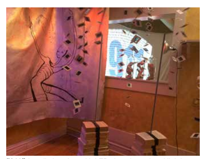
"911" installation view with LED changing colored lighting, video; sculpture by Angela Swan; and music by Cellmod