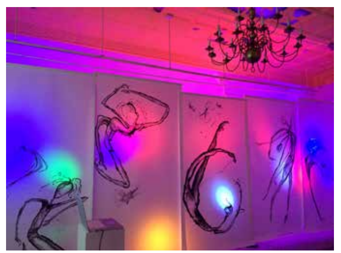
"the END is the beginning" installation view with LED changing color back-lit lighting and animation video