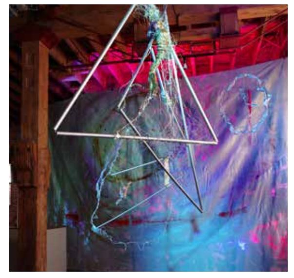
5 of 19