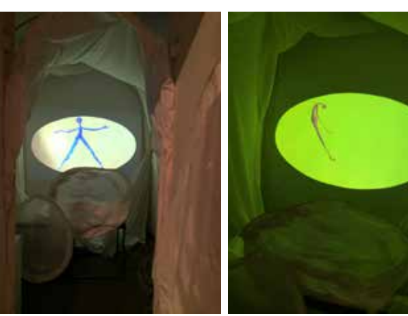
"Synapse" details, installation view with synchronized LED colored lighting; TOP photos by Victoria Senn